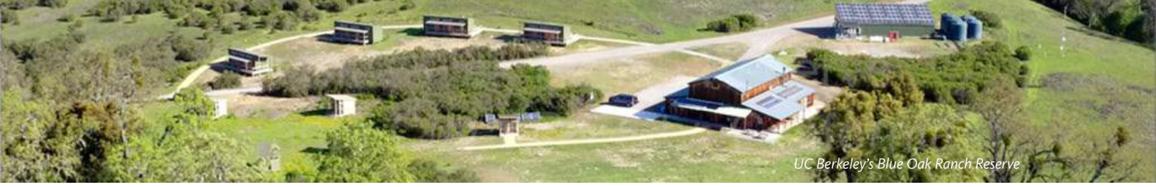
UC Berkeley's Blue Oak Ranch Reserve