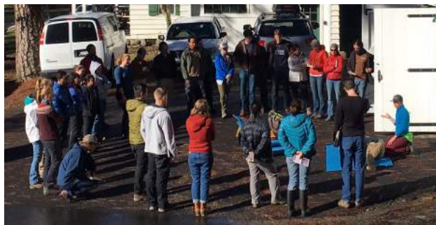
WFA training at UC Merced's Yosemite Field Station

Wilderness First Responder (WFR) course are both taught at numerous UC campuses. Other training providers within California include Sierra Rescue , Wilderness Medicine Associates , and Foster Calm . For trip leaders, field scientists, or students that plan to pursue a career doing outdoor work, WFR training is highly-regarded professionally and will prepare individuals to manage a broad-range of emergency situations, illnesses, and injuries.