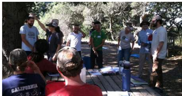
WFA training at UC Botanical Garden